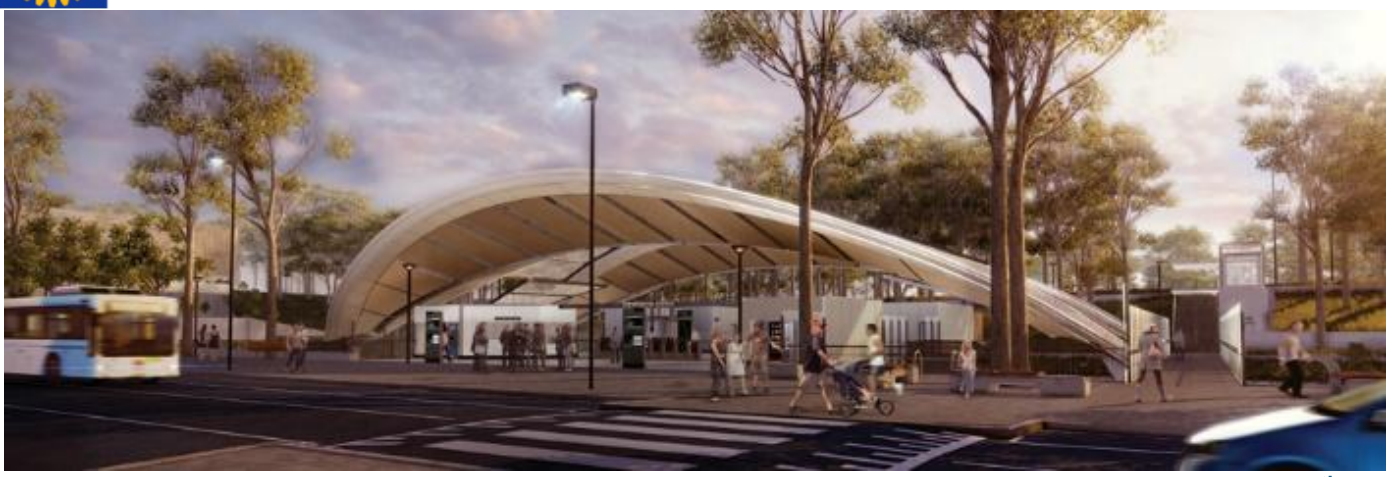
Volume 29, Issue 28, 7<sup>th</sup> March 2016