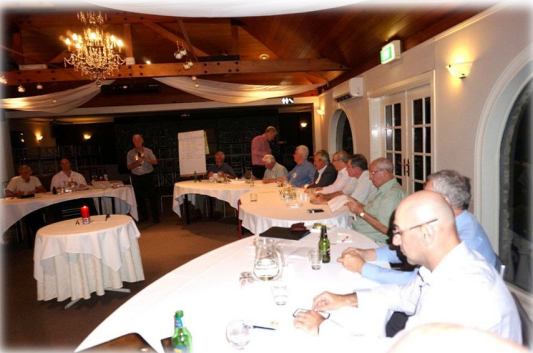
Volume 28 Issue 16