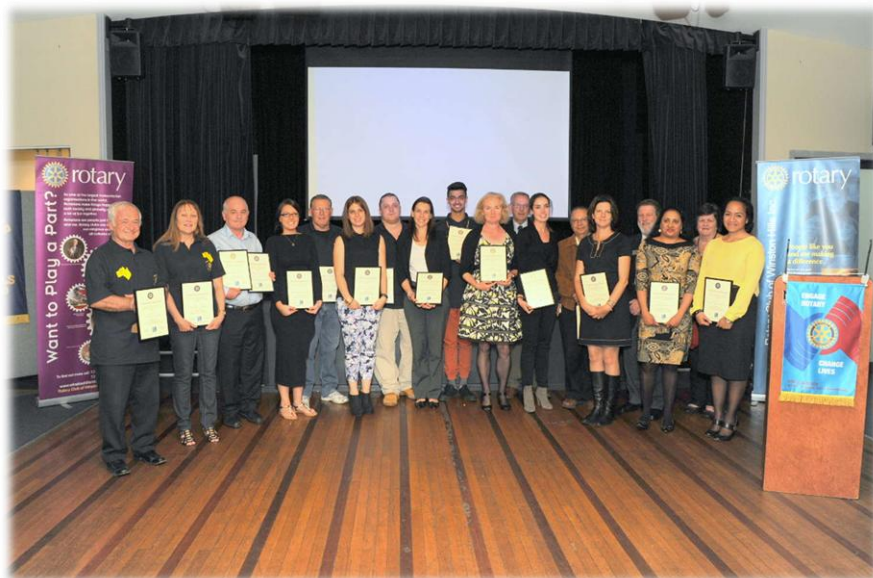
All Award Recipients for the Night