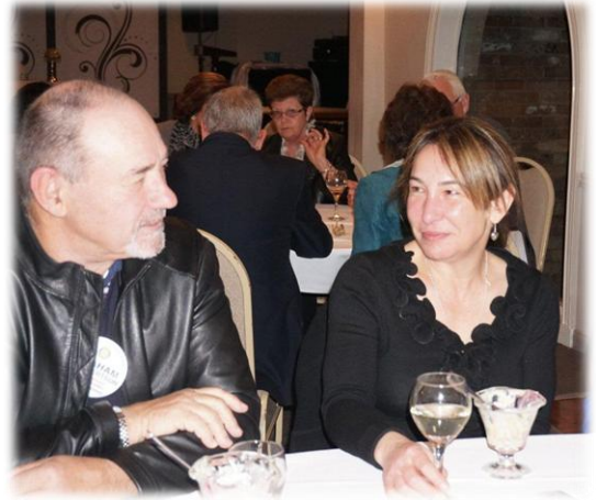
Our guests for the night