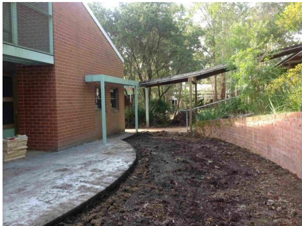
Now you see it! (The curve part of the concrete slab)