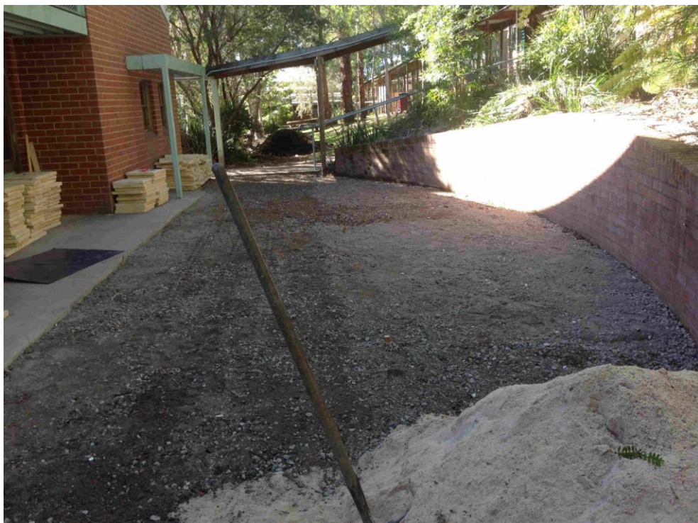
A good morning's work.... Site levelled and road-base applied (But who left it there or did you see that!)