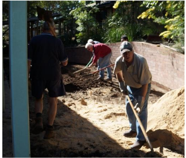
All hands on deck