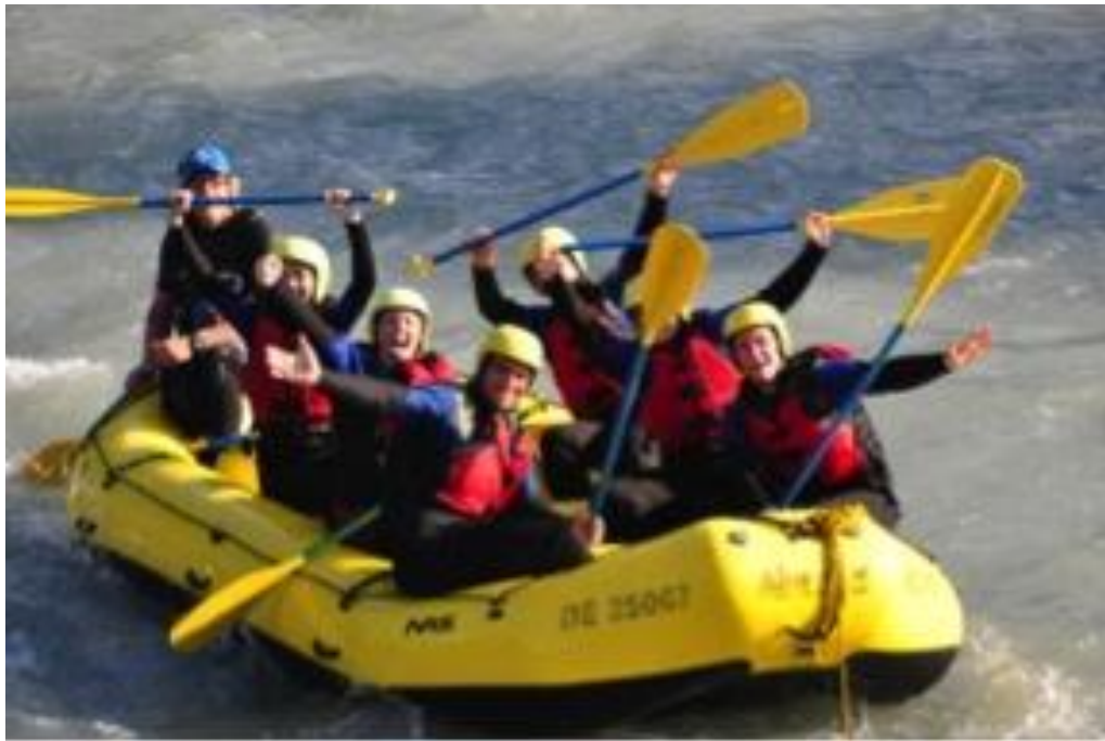
Me and the others on my boat for White Water Rafting!