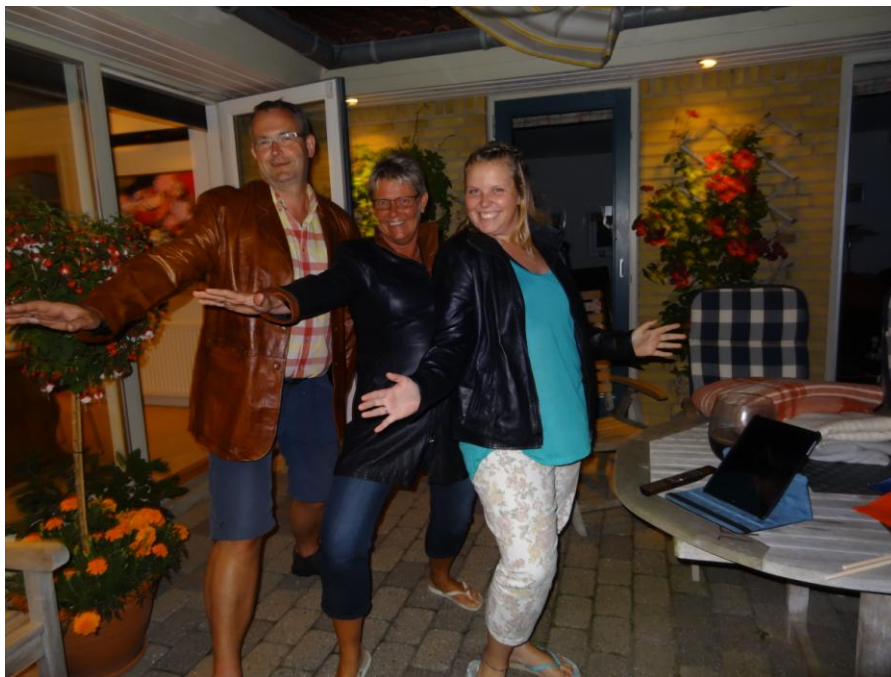
Host Dad, Mum and I in our new Leather Jackets from Florence!

I managed to find a nice leather jacket I loved, and so did my host mum, dad, sister and brother!