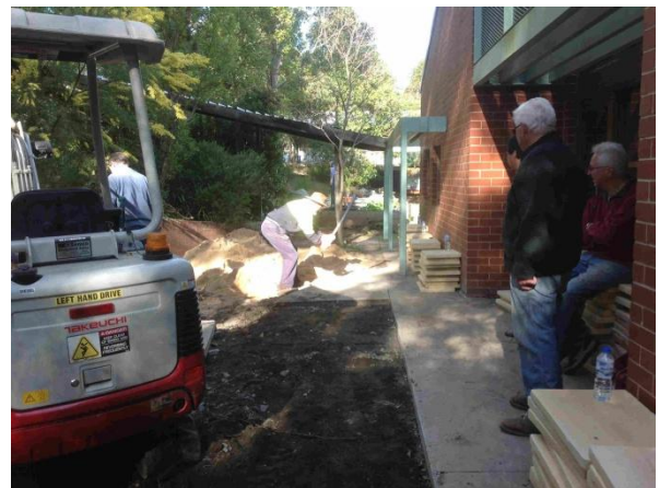
Now you don't!