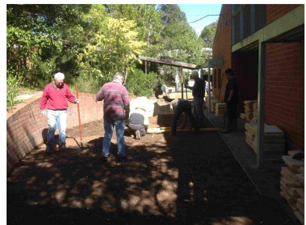
Is it level yet?