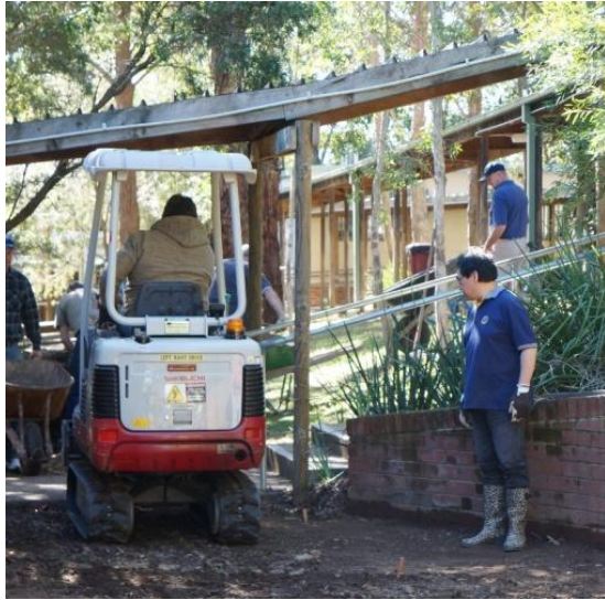
Mind the pegs