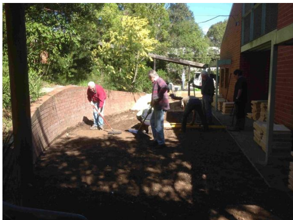
A bit more here