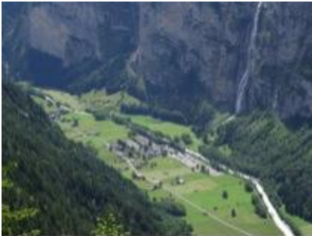
The view of our little village that we were camping in, from hiking in the Alps.