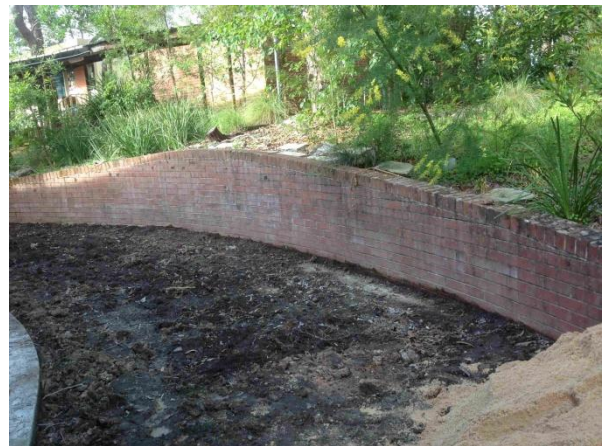
Ankle deep mud after the rain