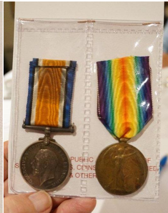
Medals in Geoff's collection