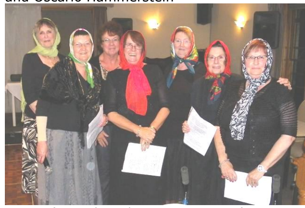
(see enlarged version on page 8)

The meeting wrapped up with a marvellous rendition from the Berlusconi singers of an old song 'My Favourite Things' from the famous Italian composers Richardo Rogers and Oscario Hammerstein