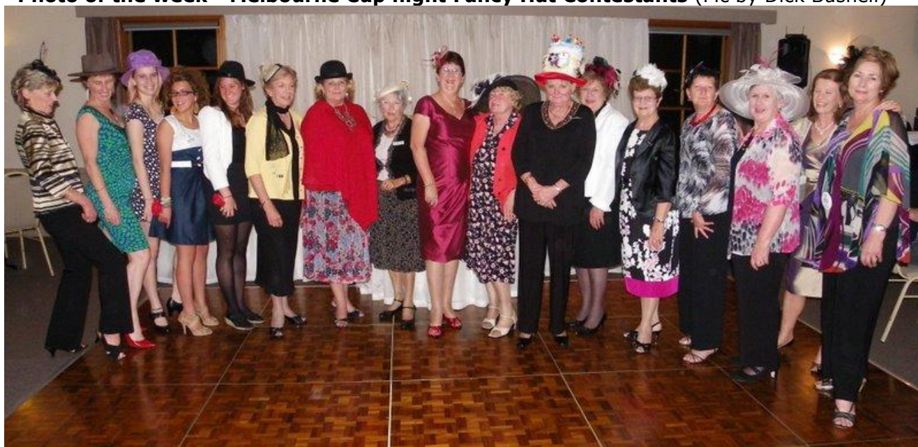
Photo of the week - Melbourne Cup night Fancy Hat Contestants