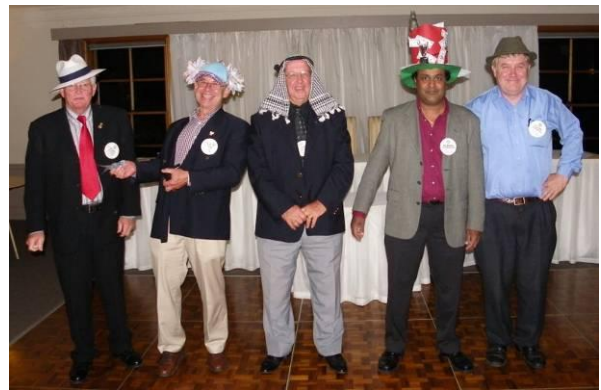
The rather ordinary group of male "fancy hat" contestants