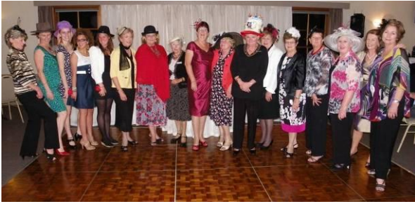
Not surprisingly, the ladies put on a much better show (See larger pic at back of this bulletin)