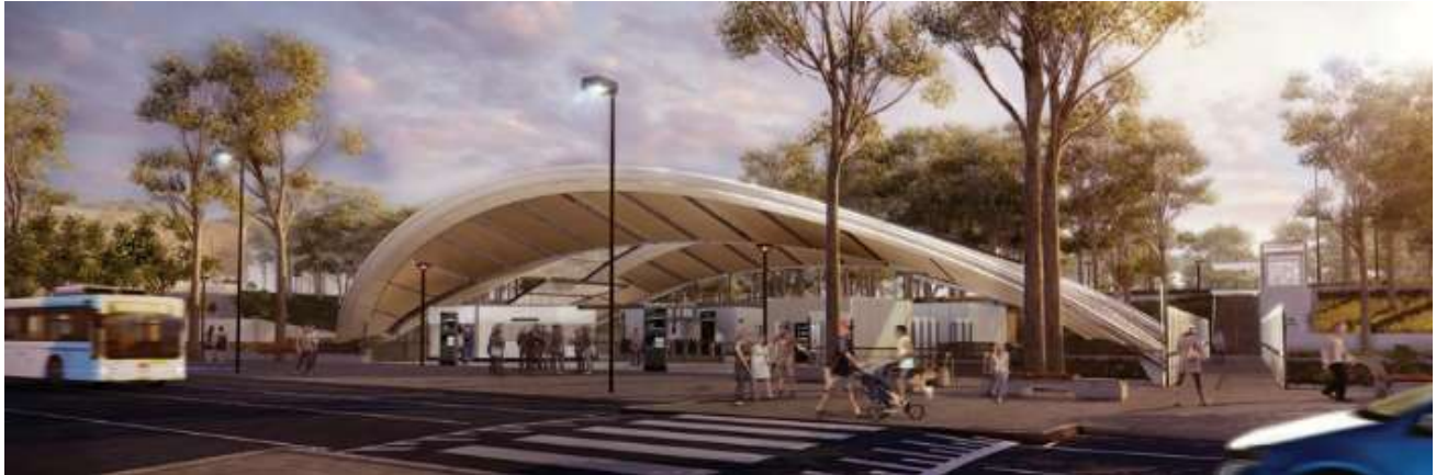
Volume 29, Issue 21, 7th December 2015