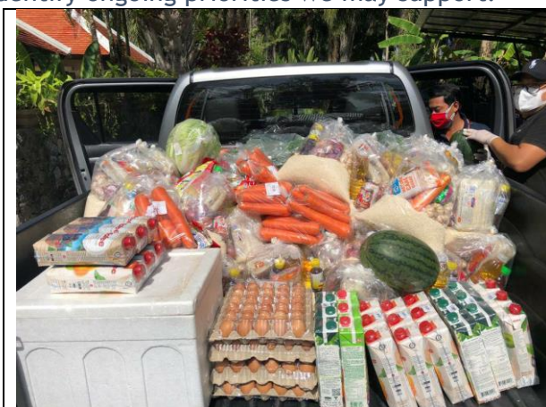
Food purchased at the market with Rotary Funds and Private donations