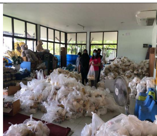
Food is packed in Family Parcels, ready for distribution