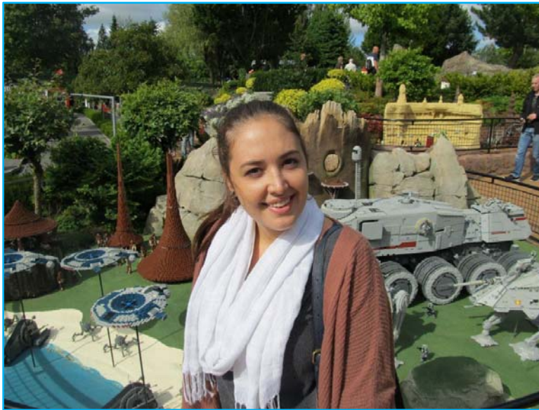
At Legoland in Denmark

I am back at school. I didn't know my Spanish had improved so much until the holidays ended. In school everyone was surprised and happy to hear how much better my Spanish was and the teachers