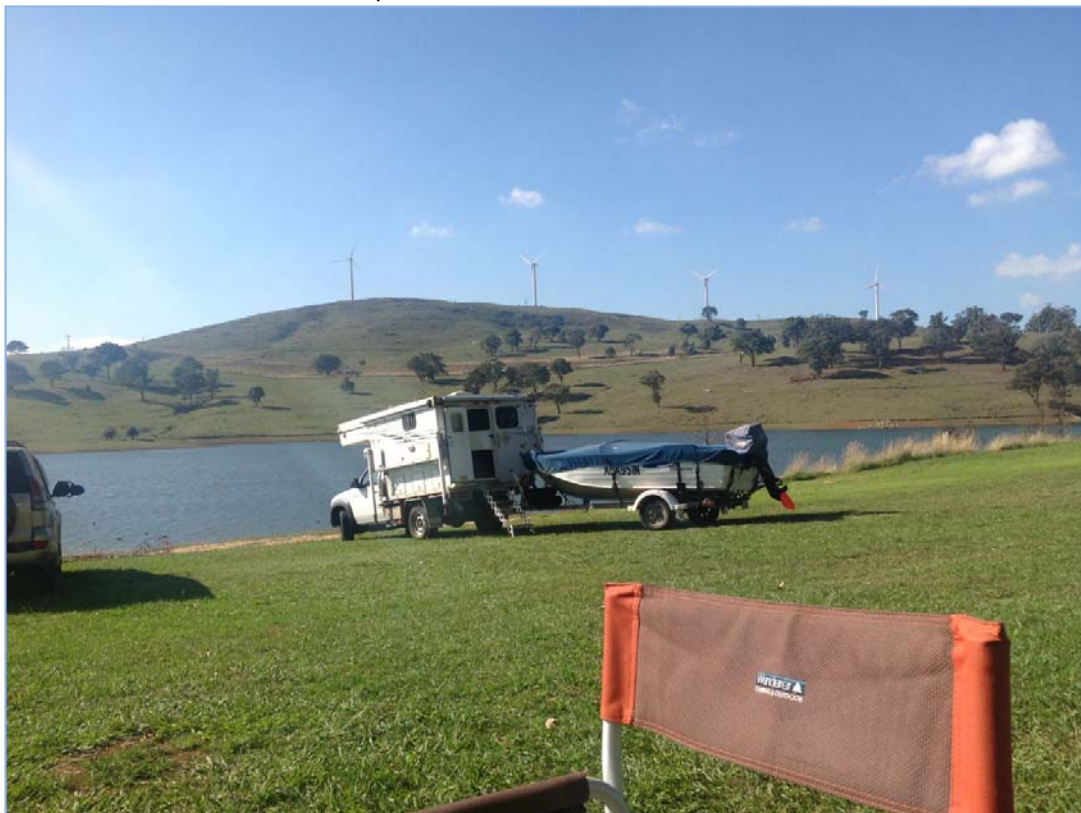
Camp Site – Sth Bathurst