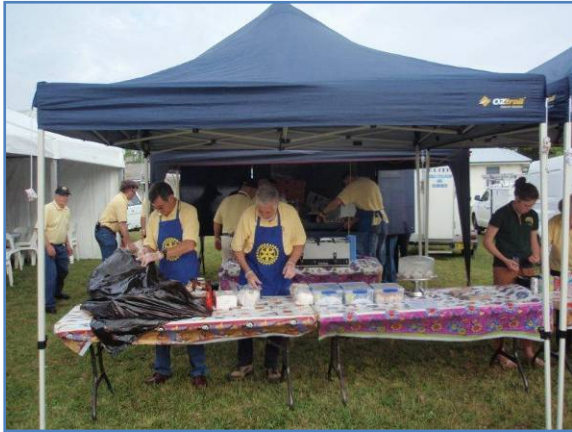
Before the Rush