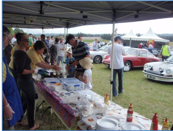
The Crowd Starting to Build