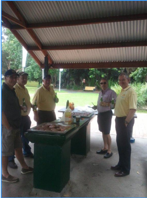
Chefs(?) kicking back before the rush