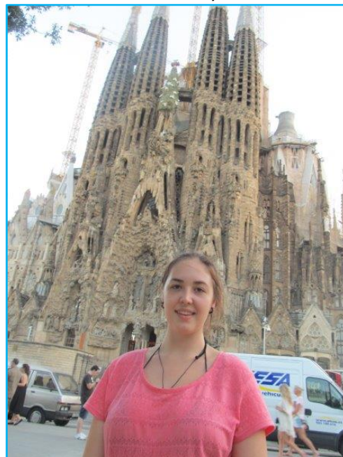
In Barcelona in July