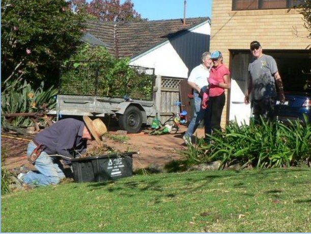
Hard at work: