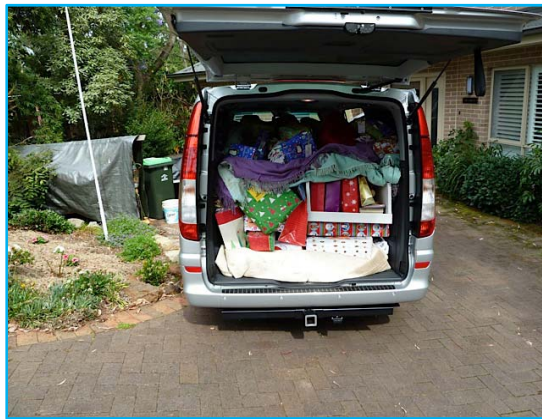
Presents, presents everywhere at the Turnbull's home! Ready for dispatch