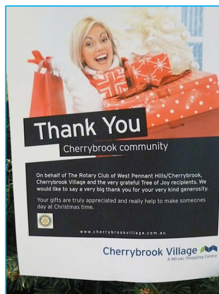
Thank you message on the Tree