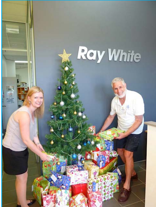
Collection from Ray White