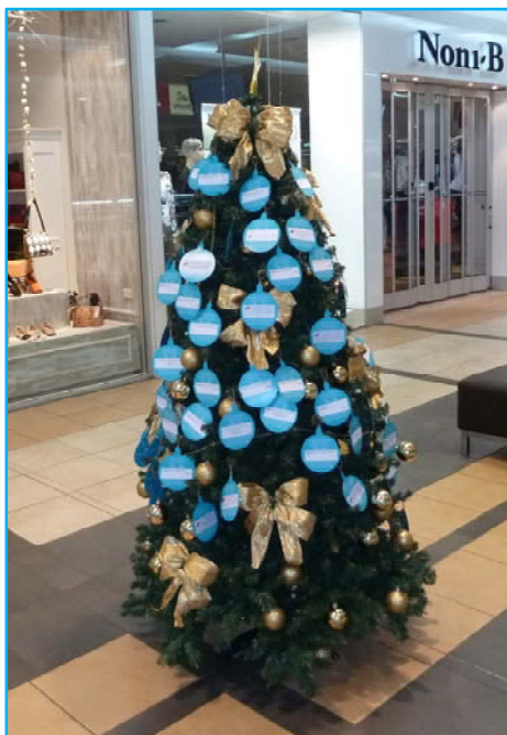
The 'Tree and its lables at the Centre