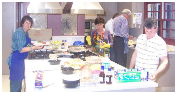
Some of the hard working kitchen crew