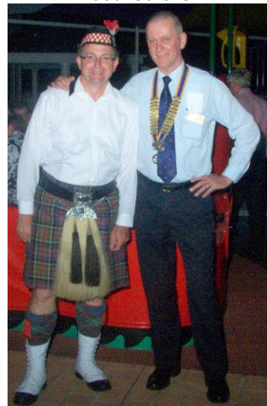
The Pipers Lament!