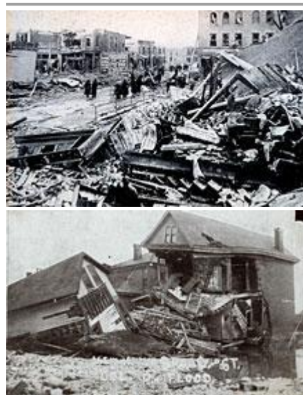
Top: Tornado damage in Omaha, Nebraska, on 23 March 1913. Bottom: Flood damage in Columbus, Ohio.

By Susan Hanf Rotary International News -- 6 January 2010