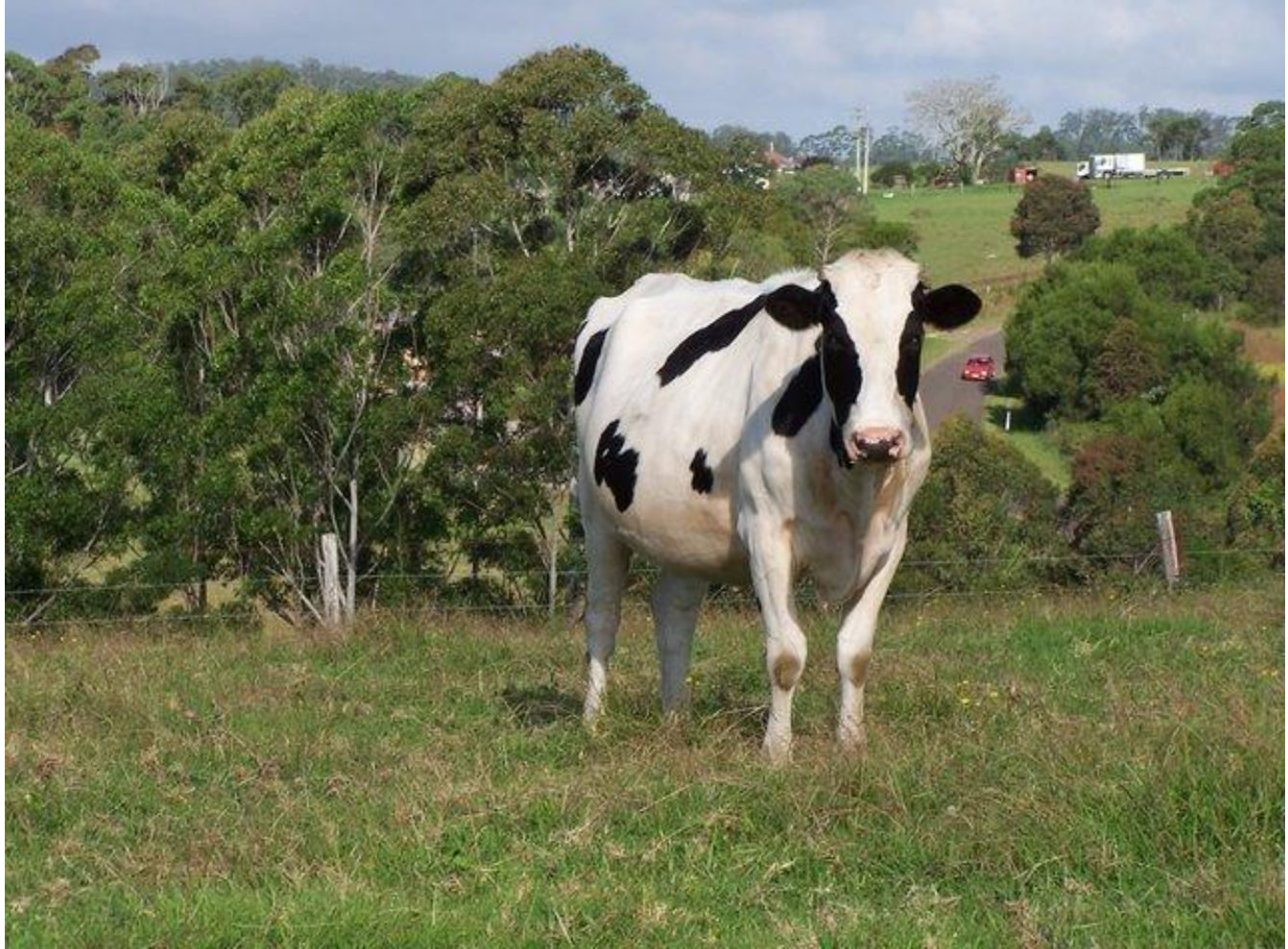
Dairy cow – Wootton NSW