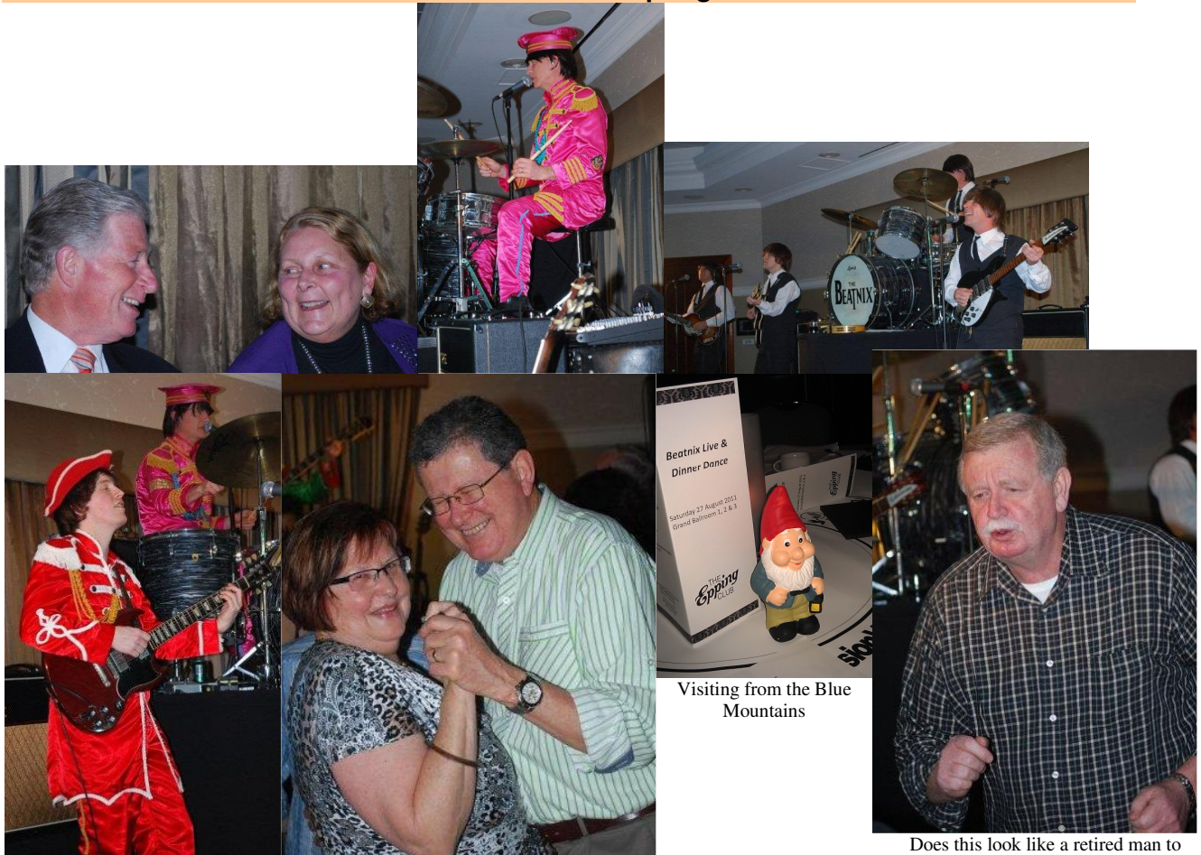
She thinks she is dancing with Andre Rieu